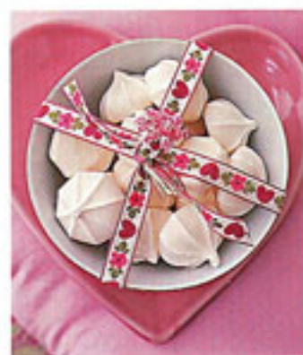
Make a bouquet even more beautiful, above: Adams used 1½ yards of pink tulle (at $2 a yard) and a fabric ribbon. To top off the gift of a bowl and plate, left, add cookies, a tapestry ribbon, and a pretty millinery flower.