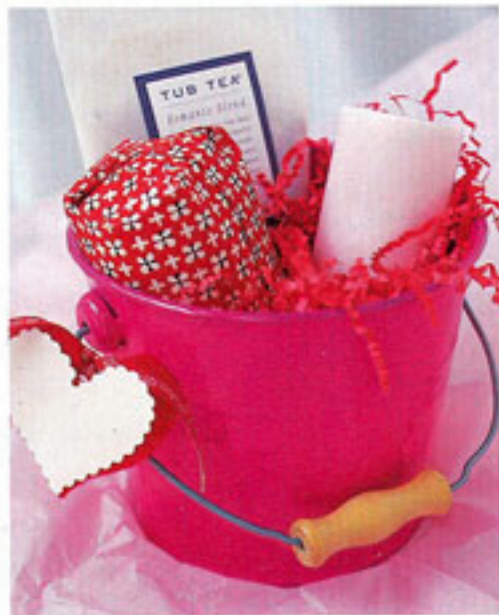
Fixings for a relaxing bath, left: To make the products look special, pack them inside a pink pail. Shredded paper adds color and cushioning. For the card, use cookie cutters to trace heart shapes onto craft felt and paper, then cut with pinking shears for a fancy edge. Perfect for a teen: a CD music mix, right. Spell out the recipient's name using the first letter of each band name or song title, and print the playlist on precut sticker labels.